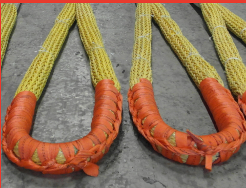
Applications of the X-TREMA GUARD®

X-TREMA GUARD® can be used in a rope's soft eye or on the body of the rope.